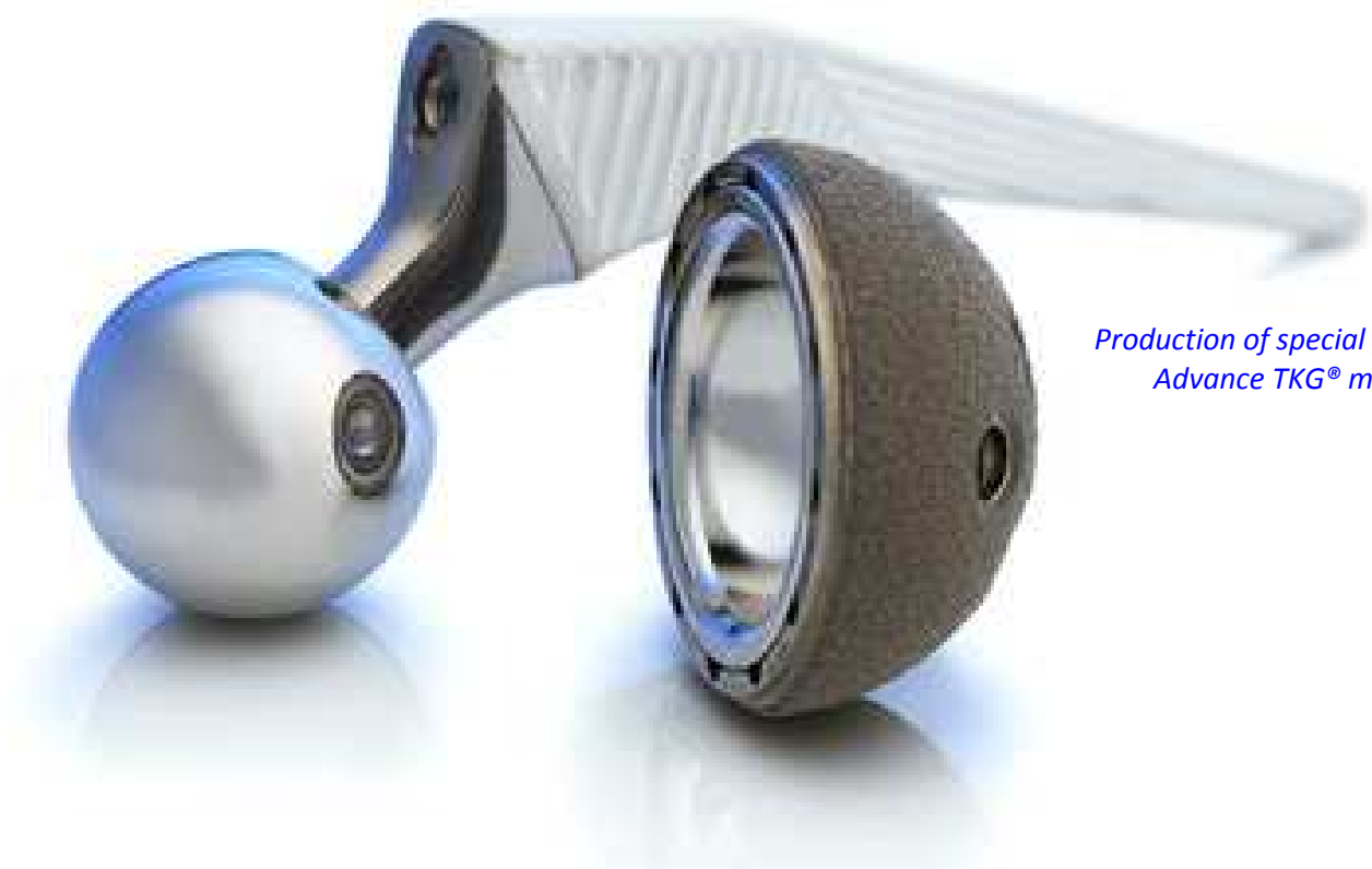
Production of special parts in Advance TKG® materials

TRAID VILLARROYA offers the medical sector a specialised material supplier and technology partner. From traditional 'advanced plastic and composites' materials to special high tech formulations, we have a high quality product that meets your needs. Our branches in Spain, Mexico and China, offer technical sales and support direct to the customer.