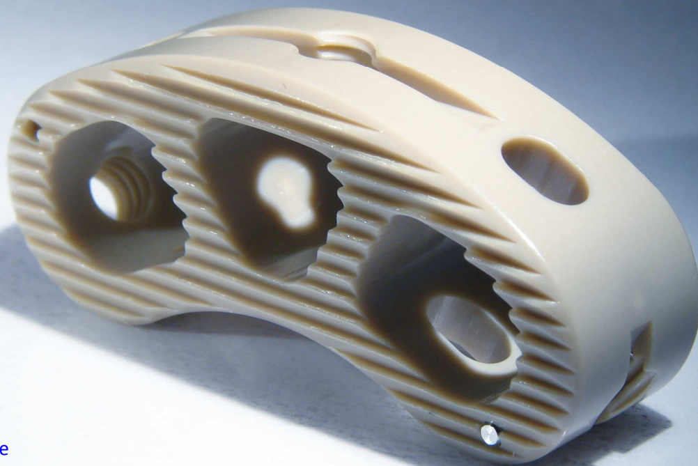
Cervical PEEK cage

And the evolution of TRAIID continues ... After all, we're more than a manufacturer. More than a distributor. We're an essential resource. Our customers' challenges keep changing, and we're helping them adapt every step of the way.